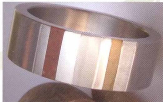
Custom men's wedding band, made with precious stones, petrified wood inlays, and recycled titanium with inlays in recycled silver. www.greencarat.com