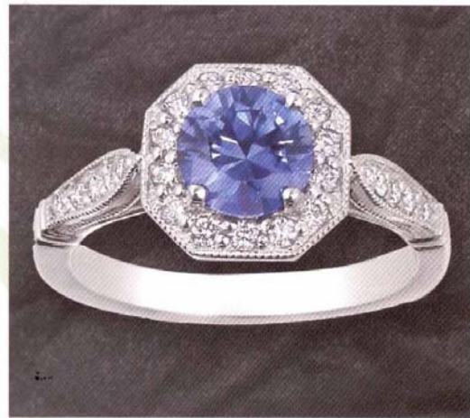
Platinum Victorian Halo Sapphire Ring, made with eco-friendly and ethically sourced gemstones and conflict-free diamonds. www.brilliantearth.com